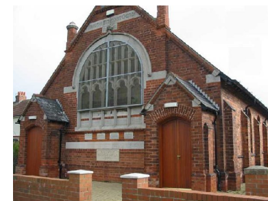
The Village Hall

The place where today much of the village social activities occur was until 2001 the Primitive Methodist Chapel. It was built in 1911 to replace an earlier chapel that was built in 1848 and demolished to make way for the new building. Designed by T B Atkinson, a Hull alderman, who also designed the chapels at Keyingham and Hessle; the existing building boasts no fewer than 25 foundation stones that can be seen in the above photo underneath the large window. An ingenious way in those days of raising funds to build the church as all those laying foundation stones gave donations. Now tastefully restored it is in regular use by the people of the village.